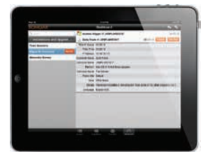
iPad Admin Dashboard